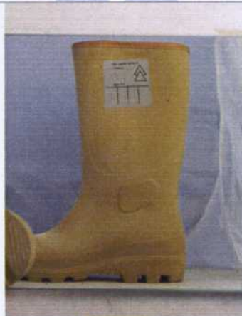
Particular of the sole