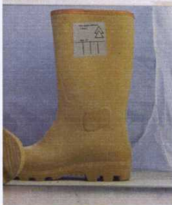
Particular of the sole